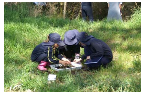
Students searching for Macroinvertebrates

According to WGCMA Wetlands Officer Matt Bowler, the Bug Blitz day gives students a rare opportunity to learn about biodiversity outside the classroom setting.