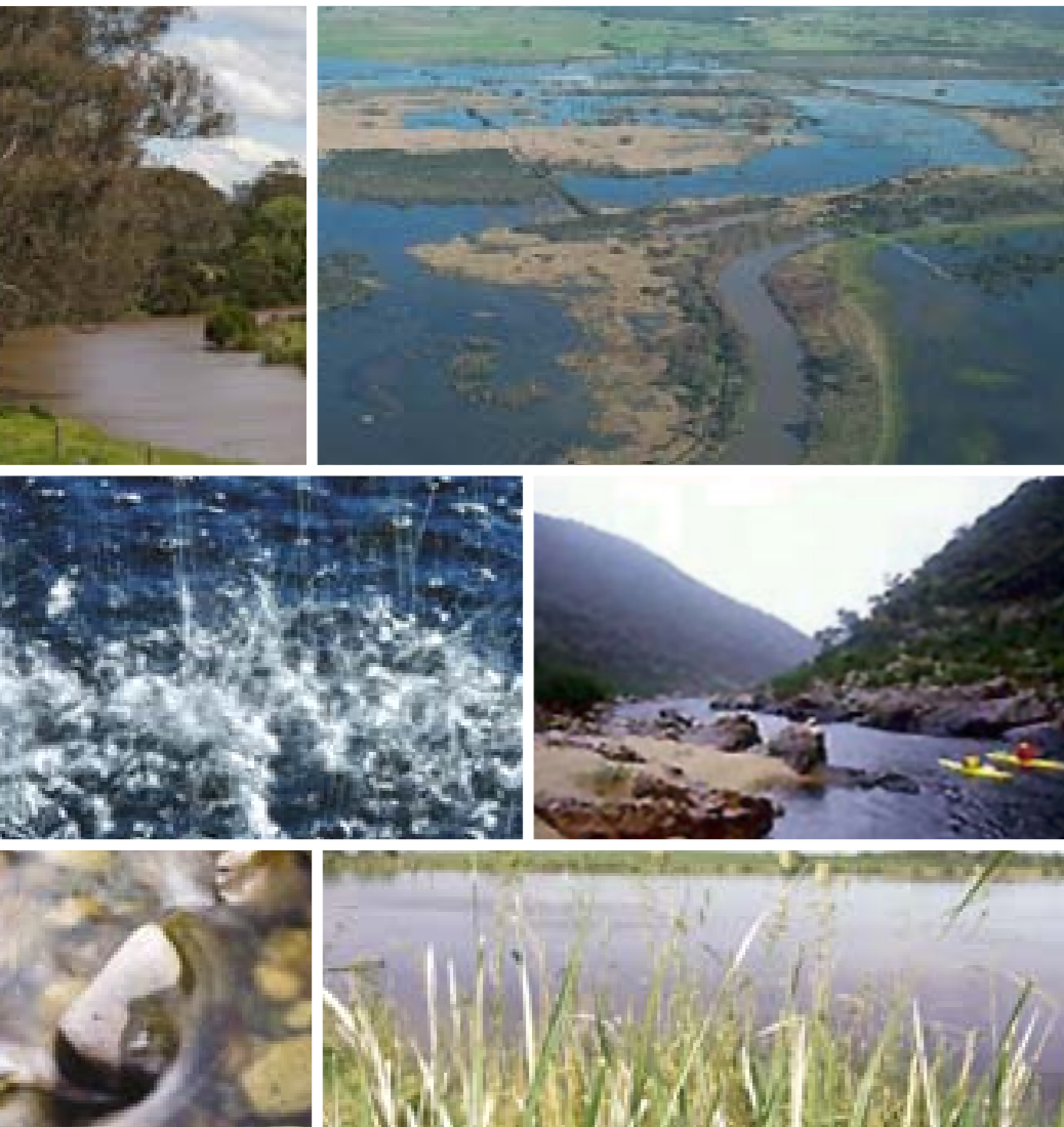
The Gippsland Region