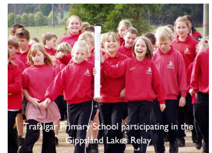
Trafalgar Primary School participating in the Gippsland Lakes Relay

We would like to extend a big congratulations to both Waterwatch teams and their volunteers. Well done guys!