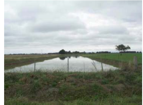
Operational Reuse system